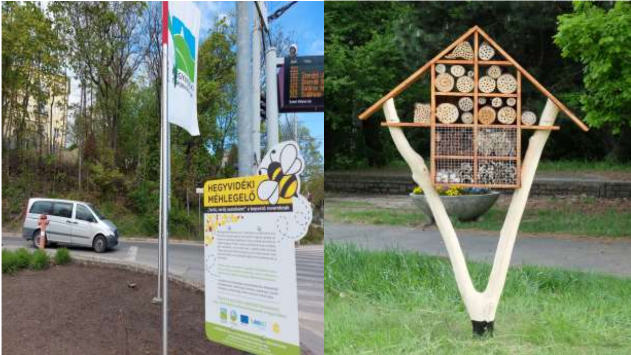
Bee pasture maintained by the Municipality of Hegyvidék.