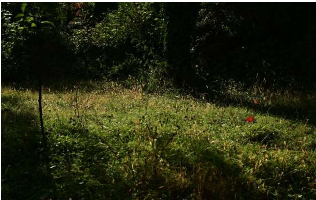
Third prize winner of a contest of nature-based gardens for private garden owners.