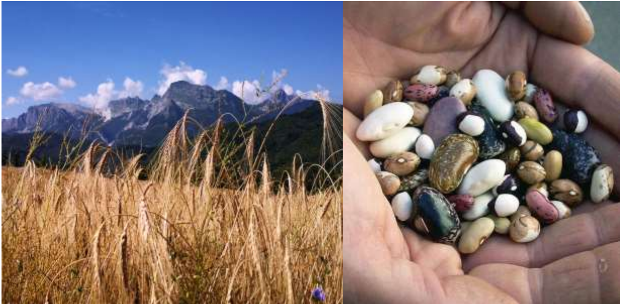
Garfagnana landscape of Toscana and an example of the agro-biodiversity heritage - variety of beans.