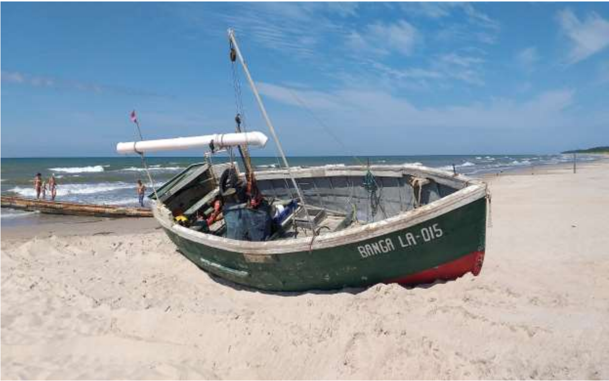
The Baltic Sea coast near Jūrmalciems.