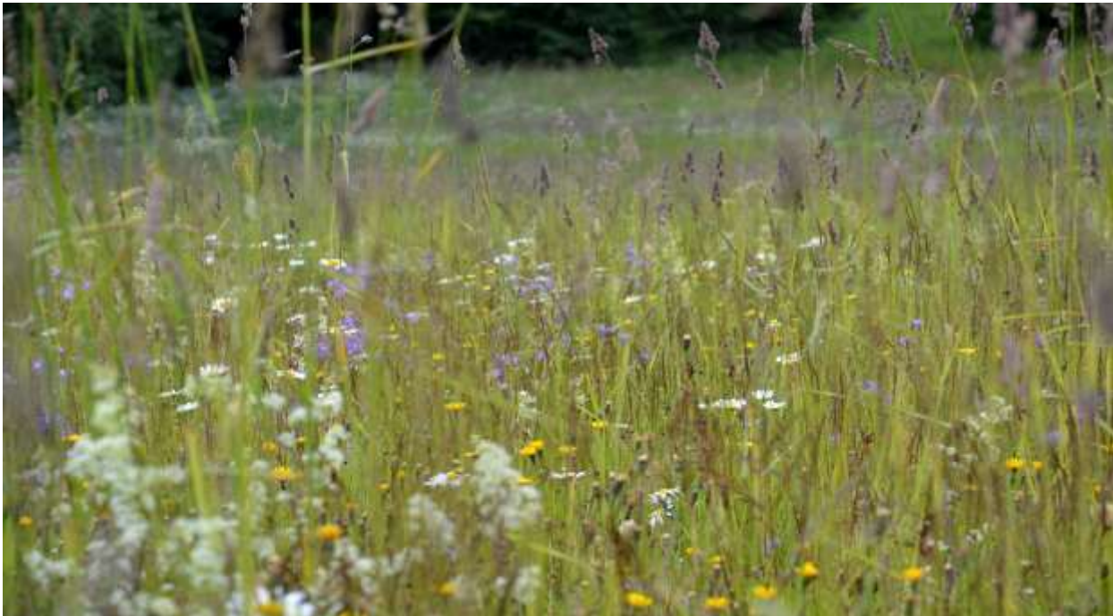
Latvian meadow in the summer.

The project “Integrated planning tool to ensure viability of grasslands” (acronym – LIFE Viva Grass) aims to prevent the loss of High Nature Value grasslands and increase the effectiveness of semi-natural grassland management by developing the Integrated Planning Tool (Tool). The Tool applies the ecosystem services approach to support decision making and land use planning by strengthening linkages between social, economic, environmental aspects in rural development policies and grassland management. This project also demonstrates opportunities for the multifunctional use of grasslands’ ecosystem services as a basis for the sustainable development of rural areas.