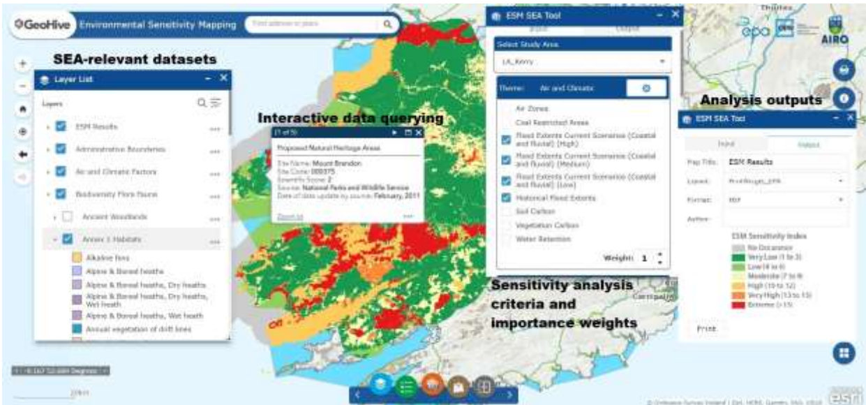
Features of the ESM Webtool