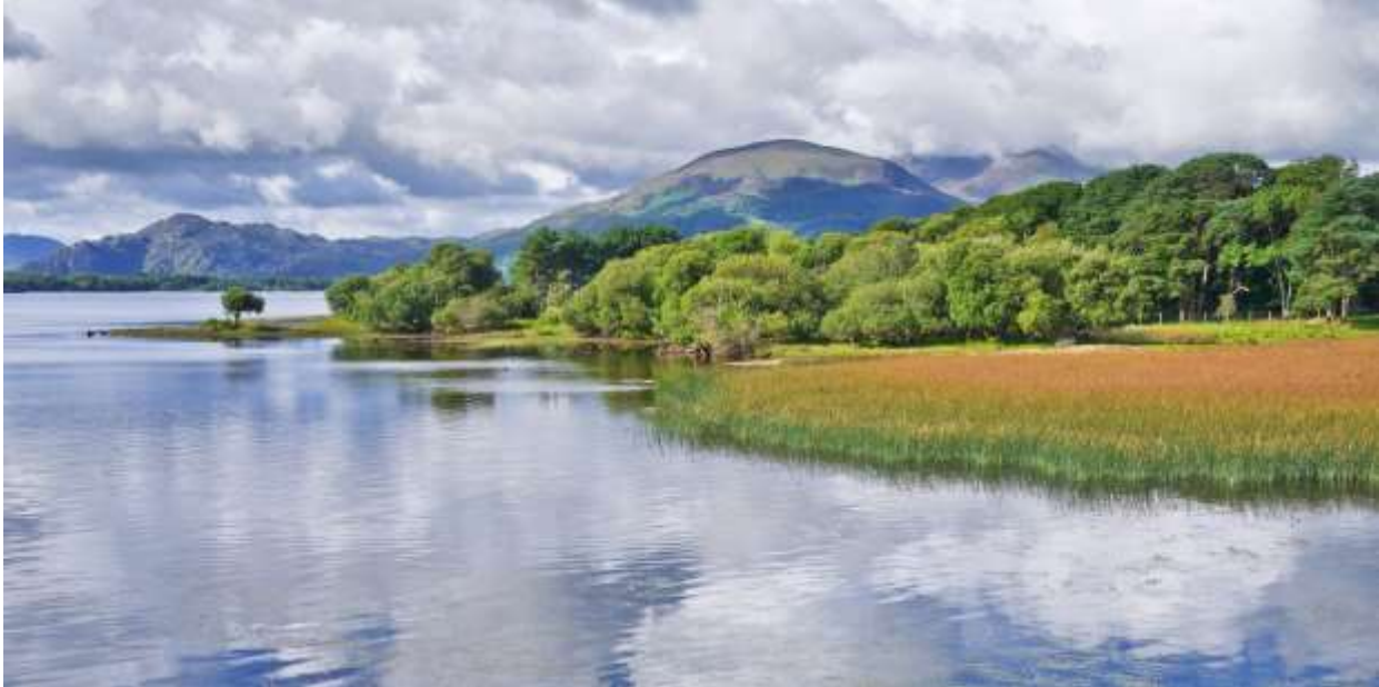
ESM Website Banner, Source: Shutterstock

The Environmental Sensitivity Mapping (ESM) Webtool is a novel decision-support tool for Strategic Environmental Assessment (SEA) and planning processes in Ireland. It is based on Geographic Information Systems (GIS) online technology and brings together more than 130 public datasets. More importantly, the ESM Webtool contains a geoprocessing widget that enables instant generation of plan-specific sensitivity maps, aiming to provide early warning of potential land-use conflicts to inform the scoping, alternatives, and impact assessment stages of SEA, and contributes to cumulative effects assessment. As well as supporting evidence-based SEA and plan-making, the tool is also useful for a wide range of other sectors and applications (e.g., environmental profiling).