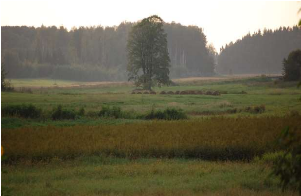
Latvian grassland in Madliena.