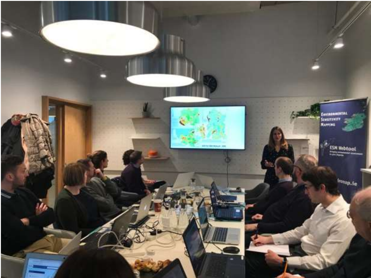
Training workshop for Regional Assembly and Local Authority planners on using the Environmental Sensitivity Mapping tool.