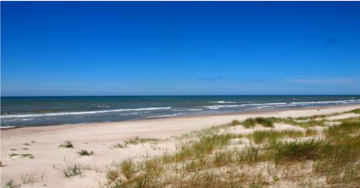
The Baltic Sea coast near Jūrmalciems, Latvia.

The project Land-Sea-Act aims to bring together stakeholders involved in the coastal management and planning to find solutions for the Maritime Spatial Planning and Blue Growth challenges around the Baltic Sea for elaborating the Multi-level Governance Agenda on the Blue Growth and Spatial Planning in the Baltic Sea Region. The project guides national, regional and local authorities, as well as stakeholders of various sectors aiming to 1) improve transnational cooperation and facilitate knowledge exchange to foster Blue Growth; 2) raise awareness, knowledge and skills to enhance the Blue Growth initiatives and integrated development in the coastal areas; 3) balance the development of new sea uses with the coastal community interests by improving the coastal governance.